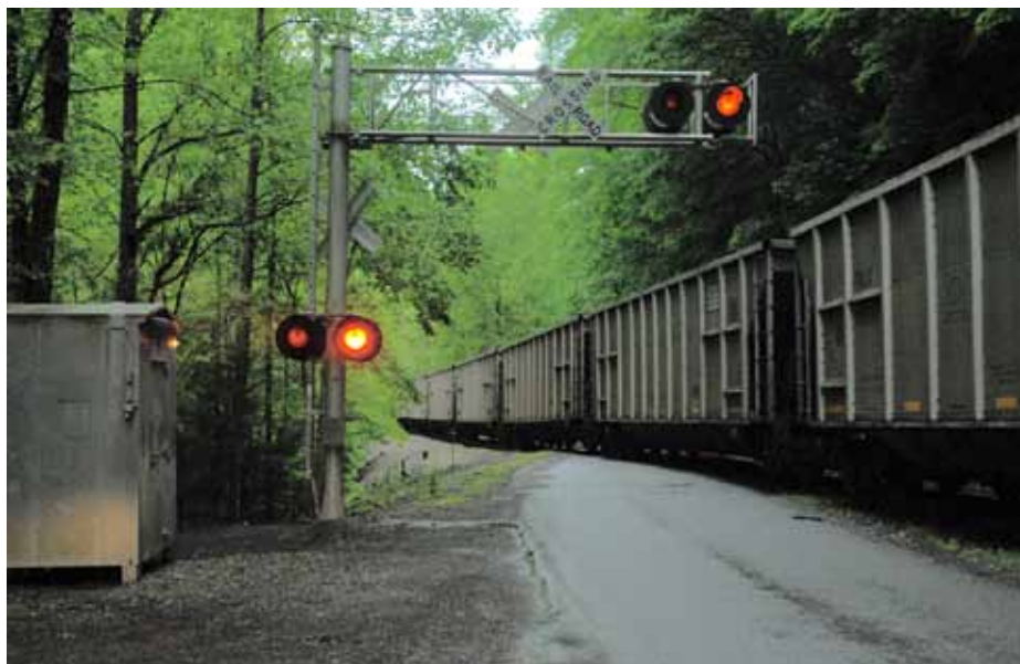
On the way to Thurmond WV during last year's Regional Convention.

Church of the Redeemer 23500 Center Ridge Road Westlake Ohio 44145