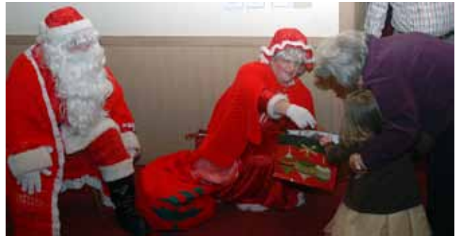
Children's Gifts from Mr and Mrs Claus