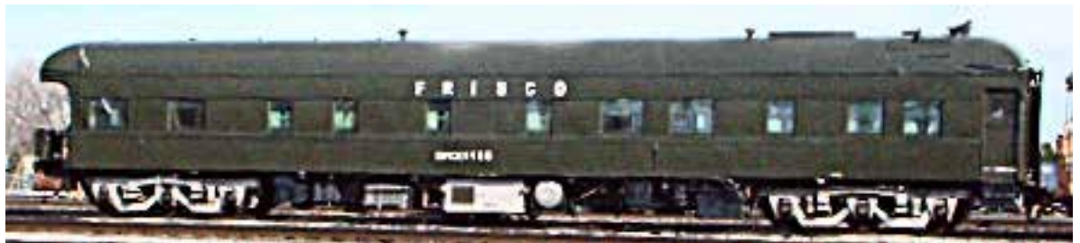
A heavyweight seen in Collinwood Yard on April 7, 2013.

This second car has a rear glass window with "stadium seating" behind it.