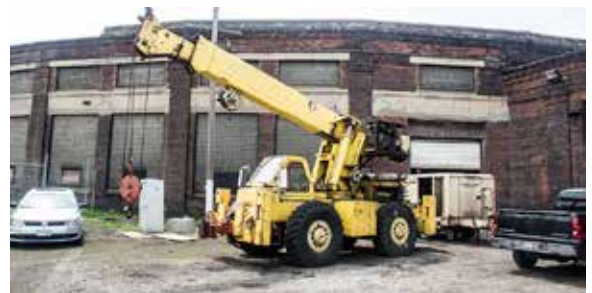
right: The roundhouse as seen from the entranceway.