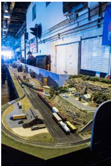
left: Div 4 modules set up in the shop area. The bright light at the end was the visitors' entrance.

The Division's modular group set up a display at Midwest's Open House on Saturday May 10th. The modules were well appreciated by visitors waiting to join the next tour. Extra points to everyone for dealing with that locomotive's horn (full size - and volume) just outside the back door - maybe they can move it next time, or use a tuba mute.