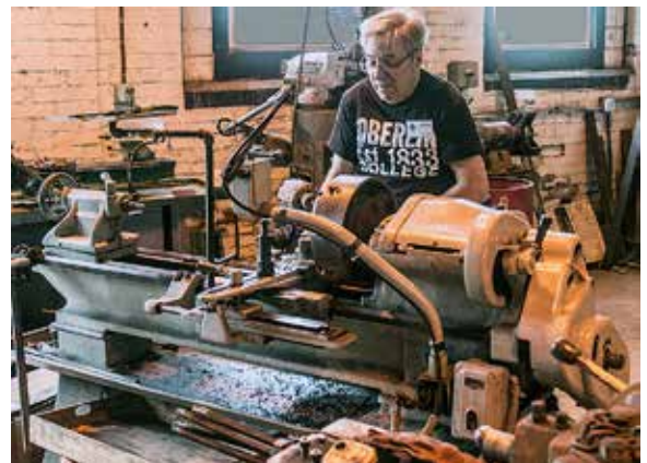
above: A volunteer demonstrates bolt making for use in steam locomotive 4070's restoration.