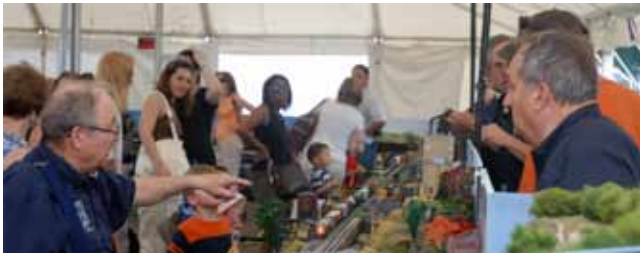
As Art mentioned in his column, the Division's modular layout drew a continuous crowd. A good location and lots of action on the really long layout made for an impressive display.