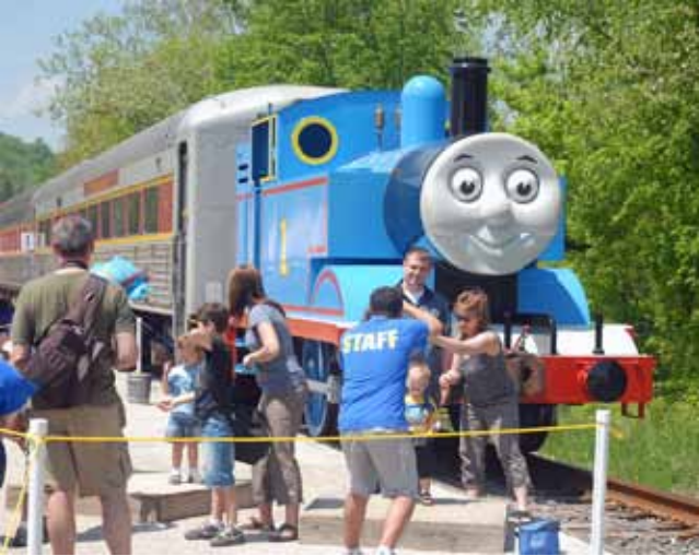
The real Thomas, giving photo ops.