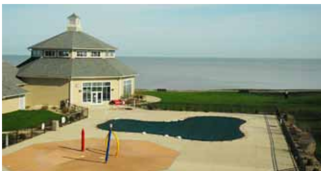
View from the hotel window

Hosted by Division 5 at Geneva-on-the-Lake