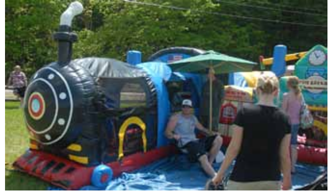
An imposter, containing numerous energetic children.