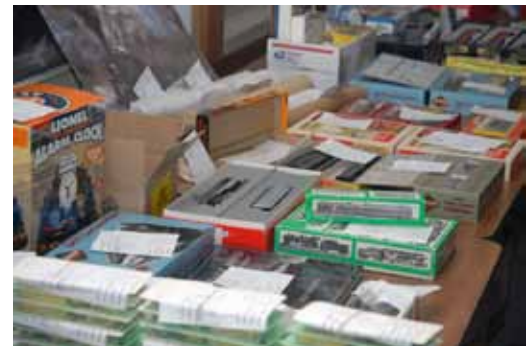
A lot of stuff showed up on the block and went home with new owners.