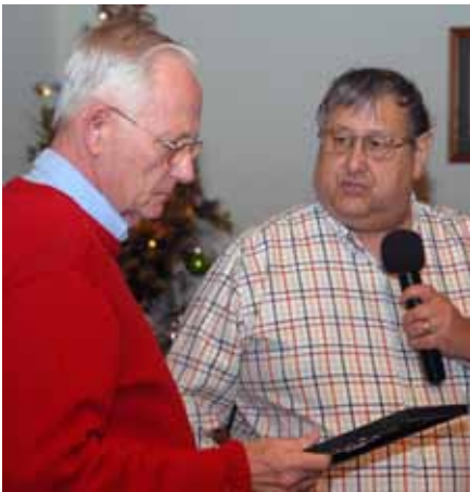
Membership Achievement Award