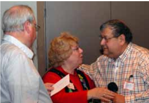
Carnival Recognition Awards