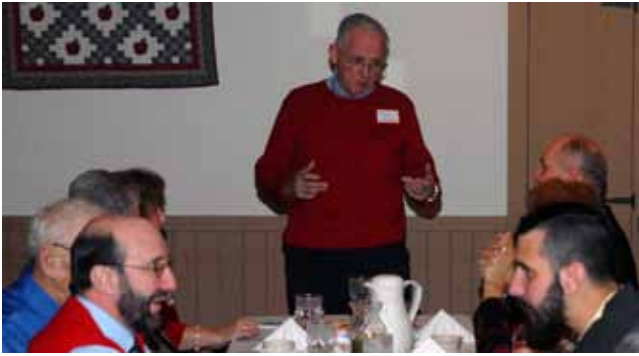
Family and Friends