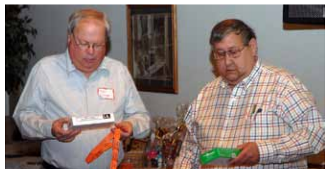
Raffle Winner (one of many)