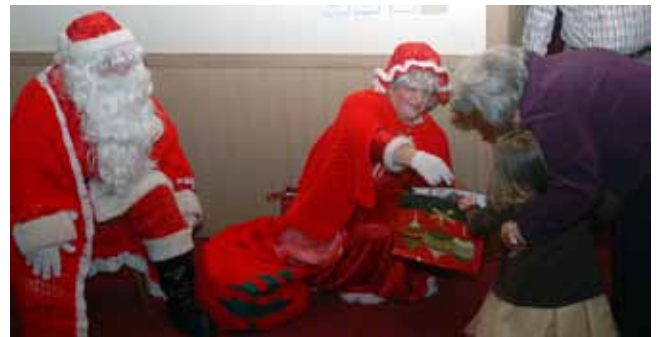
Children's Gifts from Mr and Mrs Claus