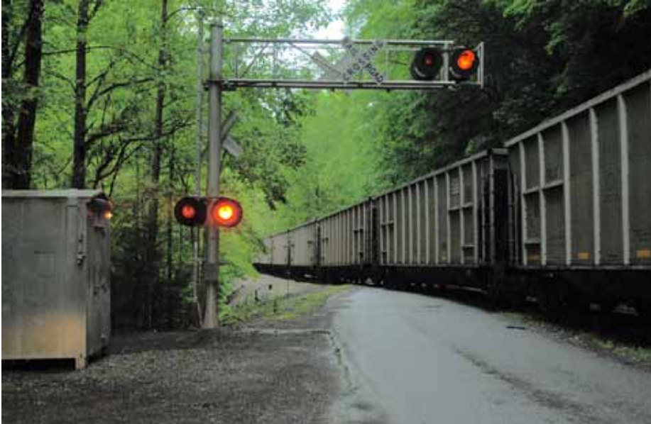
On the way to Thurmond WV during last year's Regional Convention.

Church of the Redeemer 23500 Center Ridge Road Westlake Ohio 44145