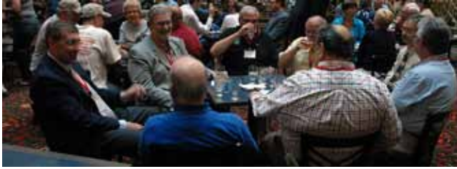
Division 4 and friends take part in the Manager's Reception during the Regional Convention.