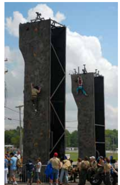
Climbing walls at Camporee - something to pass the time when they weren't busy with our trains.