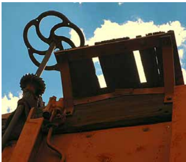
Freight car in Chama NM

Deadline for the March Flatwheel is Thursday February 25, 2010.