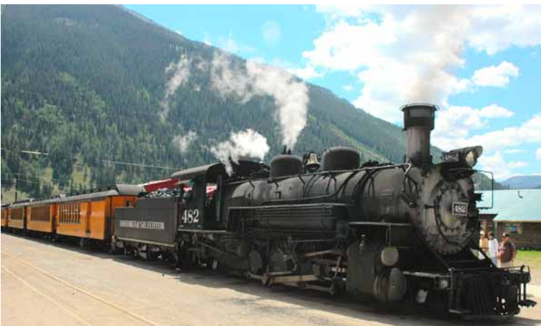
Durango and Silverton, in Silverton, CO.