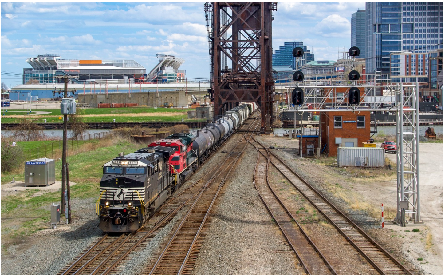
GE AC44C6MJ Taken as it clears the Drawbridge over the Cuyahoga River In Cleveland Ohio. Near Browns stadium on April 16, 2023