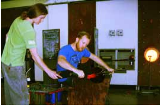
Glass blowing was featured on the Friday morning non-rail tour.

Division 2 hosted another fine weekend for the Region.