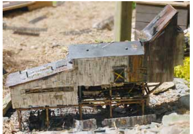
A G scale mine located on a garden layout during Sunday's open houses.