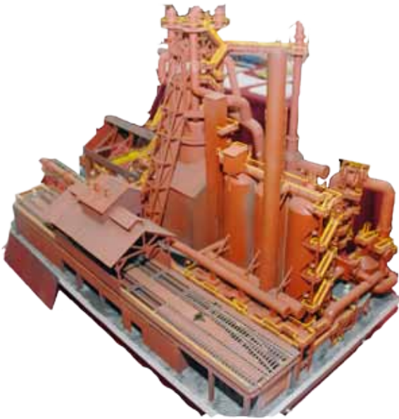
This steel mill model received a lot of attention - and votes - from judges and attendees alike.