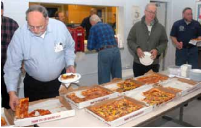
Pizza at February's Member Appreciation Night.

Read the Flatwheel online at www.div4.org