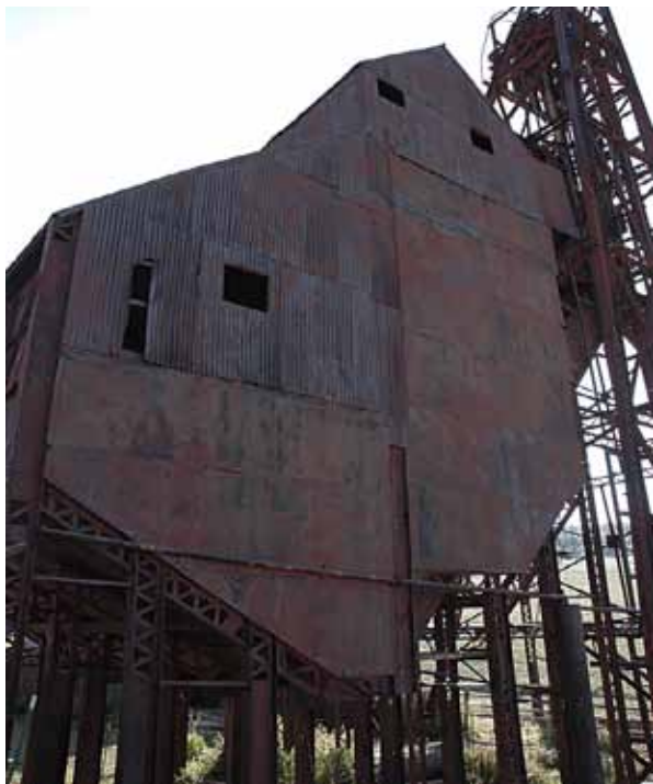
Gold mine on walking trail near Victor, Colorado (2006)

Deadline for the December Flatwheel is Thursday January 28, 2010.